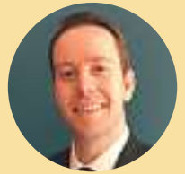
Oliver Brinsley Trade License Zone